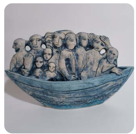
A ceramic image "Migration" by Dorinda Johnson

🕒 Check website for regularly updated opening times