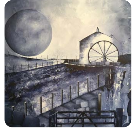
Millhouse Blue, Mixed Media on Wood, 100 x 70 cm

🕒 From April 2022, check Facebook page for details